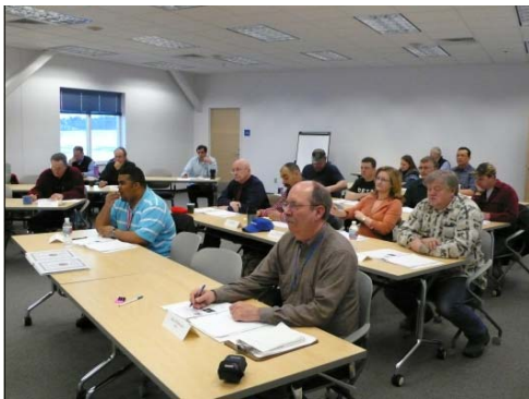
Students attending AMD's System Safety course at AKRO's new training facility in Anchorage, Alaska.